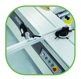
Angled cutting device