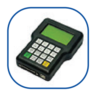
DSP control system