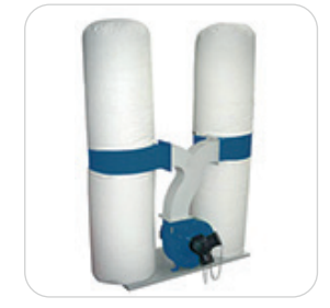
Dust reducing device